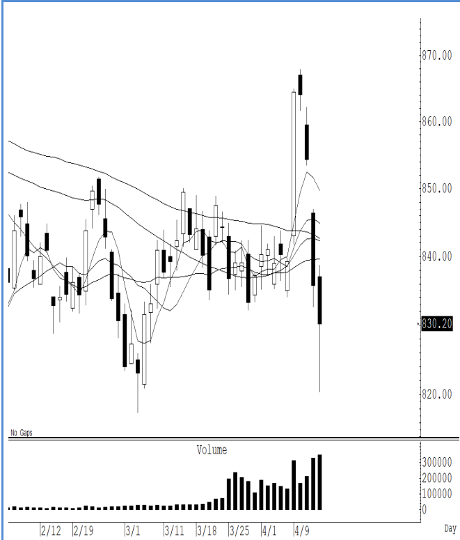
S50M24 (Close 830.20 Chg -5.60)